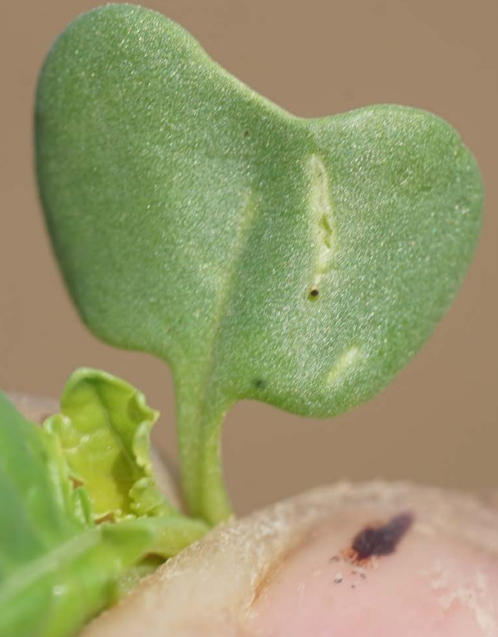
DBM mine and exit hole of broccoli cotyledon