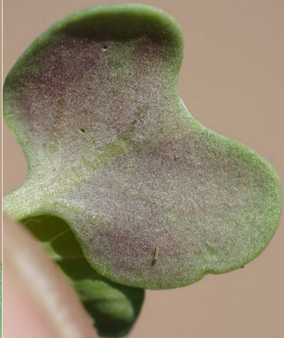
DBM larvae on 4 day old broccoli plant