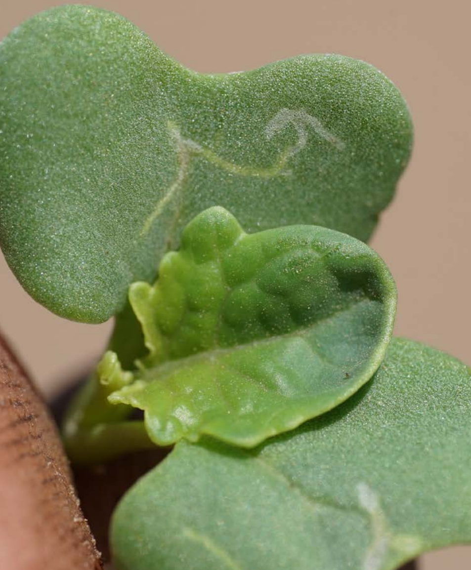
DBM mines (with exit holes on underside)